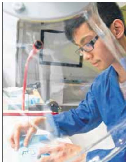
SIT's programme offerings such as in engineering (above) already have a "strong applied element", noted the ministry.